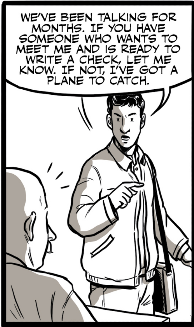
Excerpt from Mission in a Bottle , by Seth Goldman & Barry Nalebuff. Crown Business , September 2013.

ing likely no more than 25% would be for early stage seed stage investing, or $50,000. With reasonable practicalities related to transaction size, this would yield investment in at most one to two ventures, which does not provide sufficient diversification. This inability to diversify risk may decrease investor appetite for such an allocation.